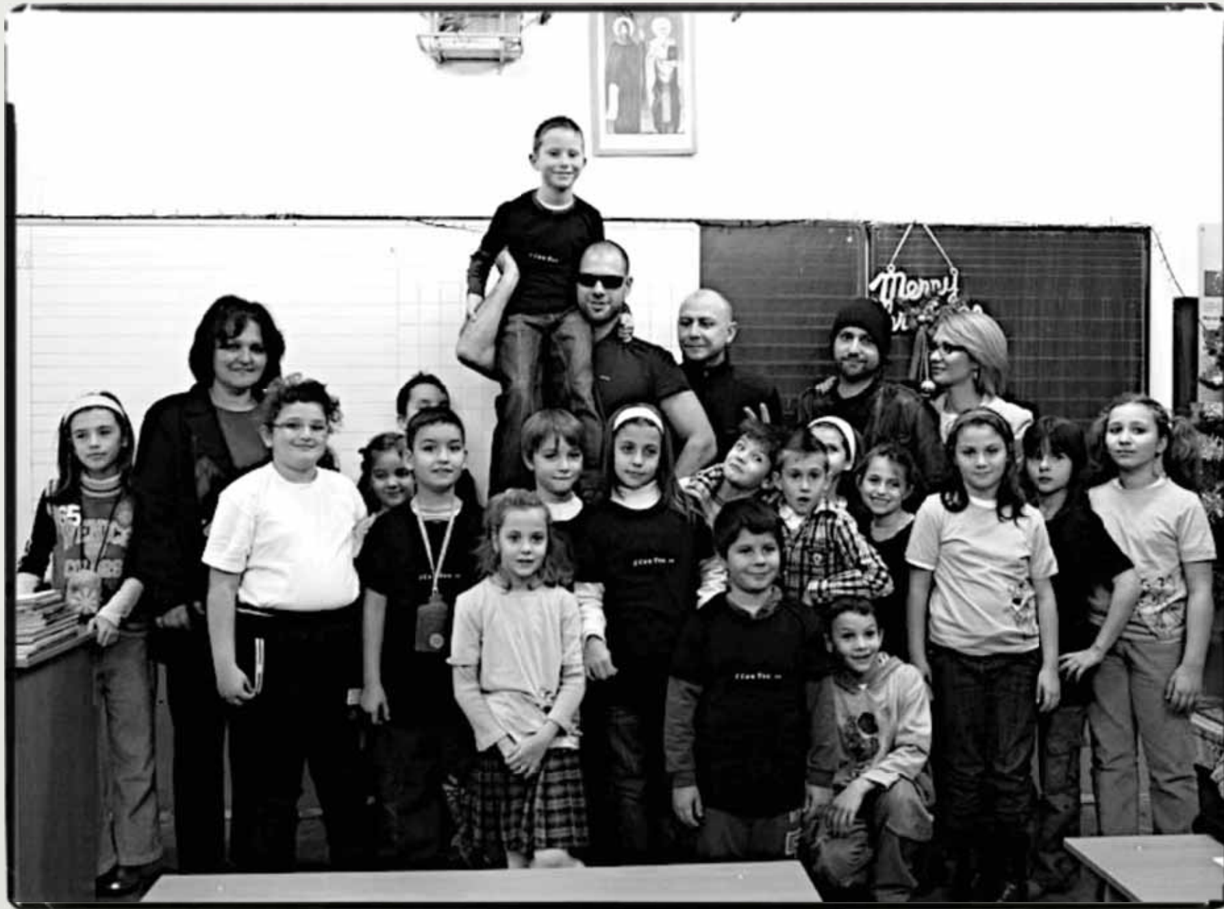
Musicians in School