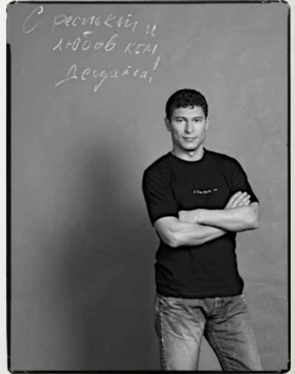
Football star Krasimir Balakov