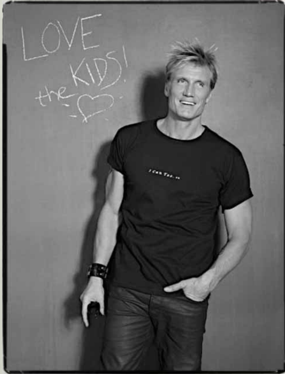
Dolph Lundgren – Hollywood actor and director