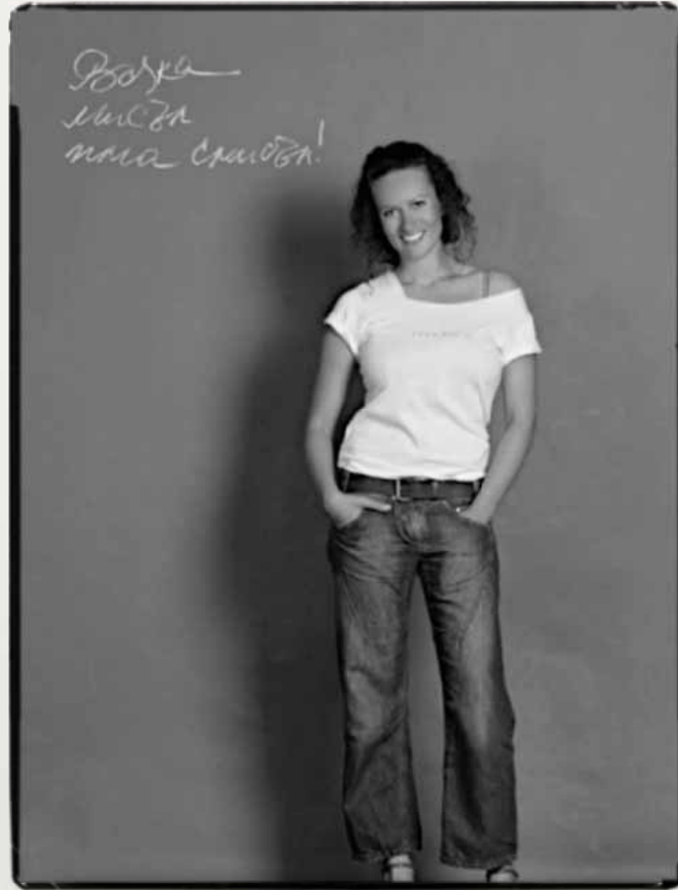
Beloslava - singer