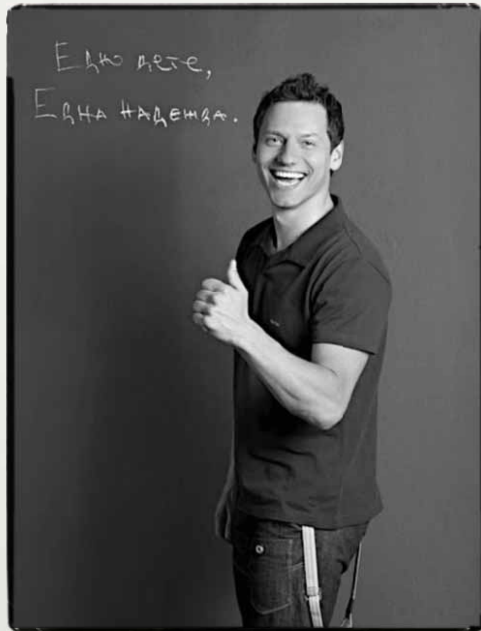
Orlin Pavlov - singer