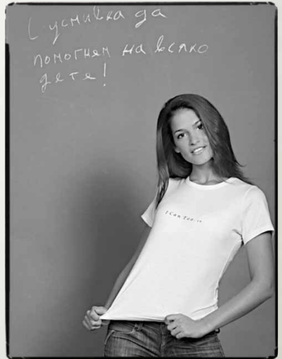
Vessela Boneva - singer