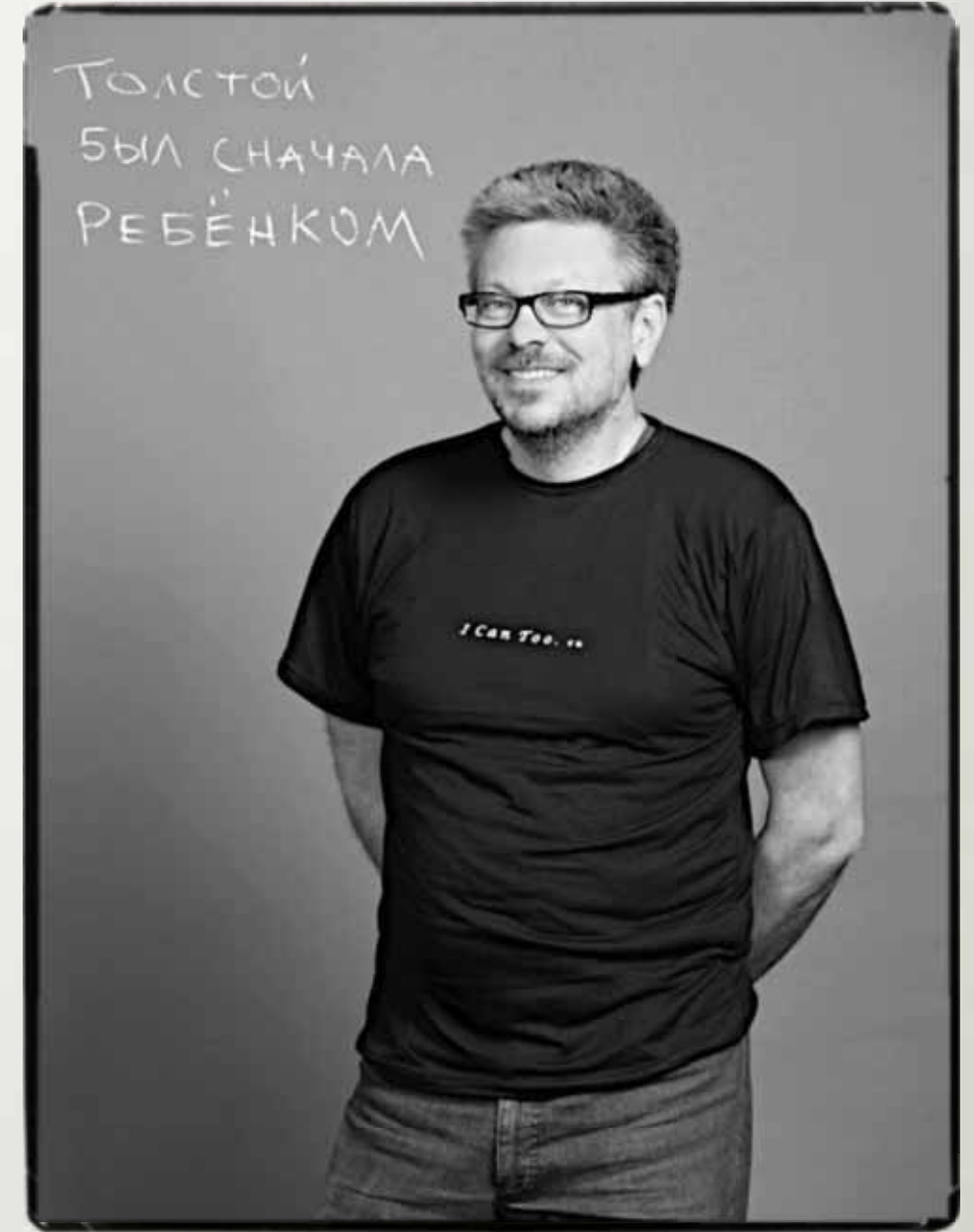
Mihail Shishkin – Russian writer. Awarded with the three most prestigious awards for Russian novel